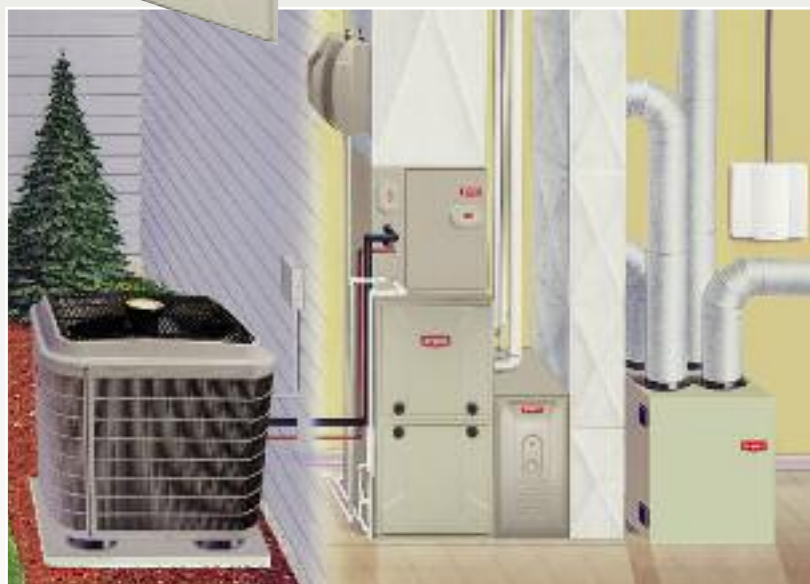
HYBRID HEAT® Dual Fuel Heat Pump and Gas Furnace System