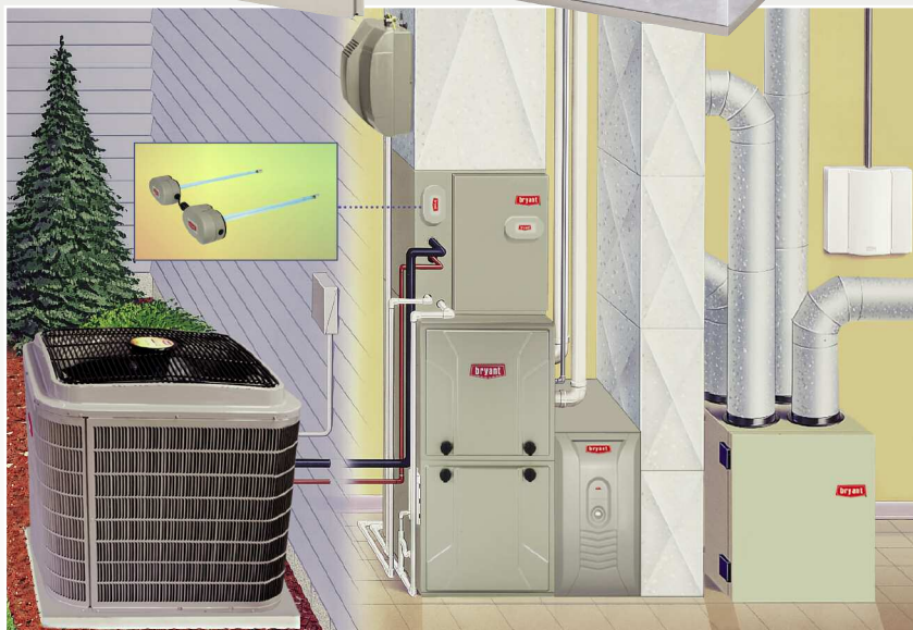
Air Conditioner and Gas Furnace System