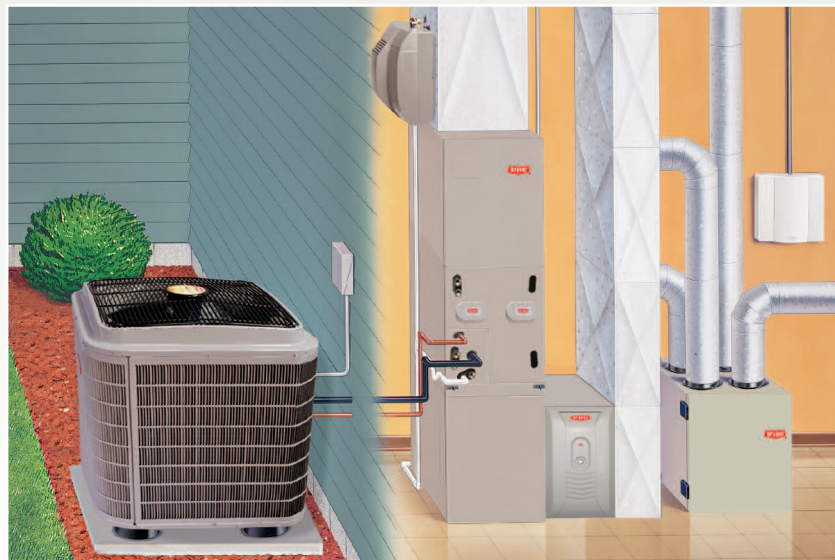
Heat Pump and Fan Coil System