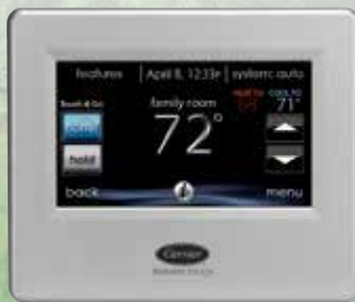
Infinity® Touch™ Control

* Full Infinity® System with the Infinity Touch™ Wall Control with Wi-Fi® capability. Remote access requires Wi-Fi model wall control and Apple™ or Android™ mobile device. Energy Tracking requires compatible equipment. Wi-Fi® is a registered trademark of Wi-Fi Alliance Corporation.