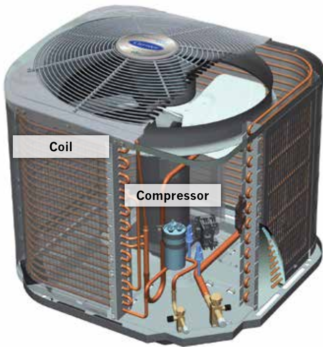
Performance™ 17 Air Conditioner Shown

* Upon timely registration. The warranty period is five years if not registered within 90 days of installation. Wi-Fi® is a registered trademark of the Wi-Fi Alliance Corporation.