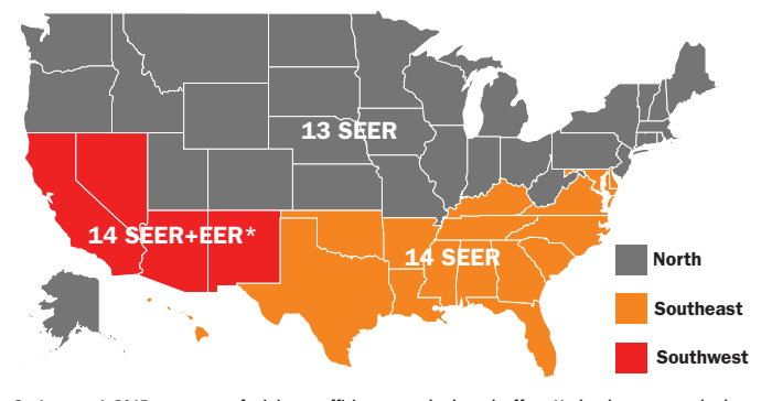
On January 1, 2015, a new set of minimum efficiency standards took effect. Under the new standards, there are different efficiency minimums for air conditioners in each of three regions—North, Southeast and Southwest. The national minimum efficiency standard for heat pumps is 14 SEER/8.2 HSPF.