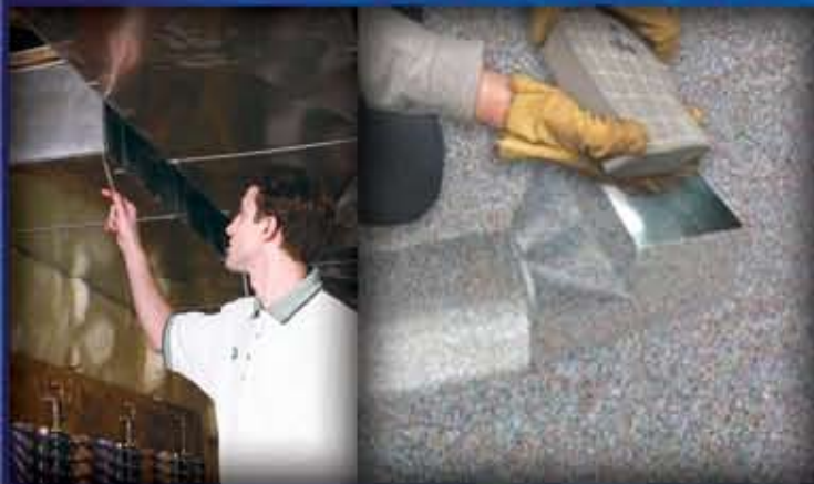
AeroSeal technician conducts initial diagnosis by analyzing airflow