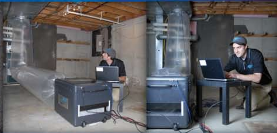
A professional AeroSeal technician will monitor the duct leakage in your home