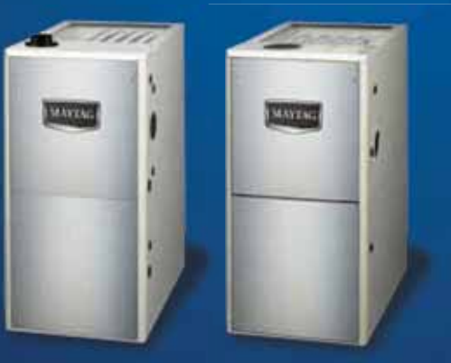
M1200 Two-Stage, Variable-Speed Heating Comfort