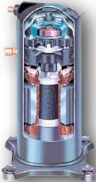
Copeland Scroll® Compressors have fewer working parts than reciprocating piston compressors for quieter operation, longer service life and reliability.

The high-efficiency condenser motor and fan blades provide quiet operation and low vibration. Your packaged unit is only one part of the comfort system that affects your air quality and energy savings. Maytag offers a complete line of system components to improve indoor air quality and help ensure the performance of your comfort system.