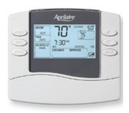
Aprilaire Programmable Thermostat $ 184.00 (Regular cost $ 204.00) (Includes Installation)

Convenient 5/1/1 day (weekdays, Saturday and