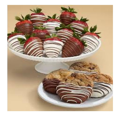
Chocolate Covered Anything Recipe

Prep time: 5 mins Cook time: 2 mins Total time: 7 mins