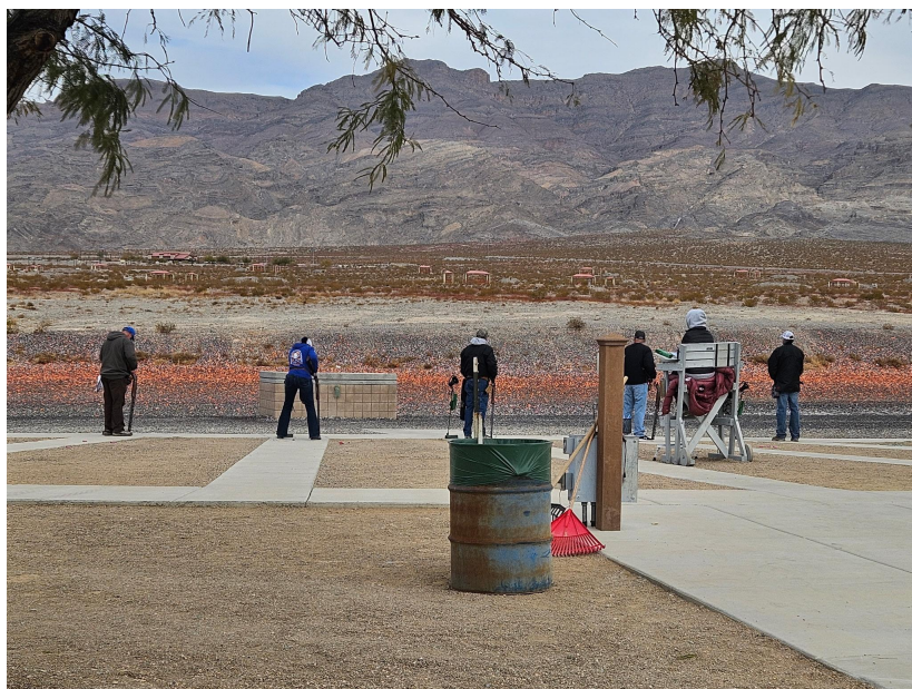
Some of the almost 50 shooters take the line at the Silver Shootout.

Shooters from six states competed for the silver at this year's shoot. As the shoot ended, many were making plans to return for the 2026 edition.