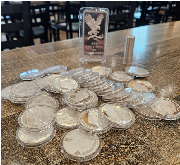
Over 50 ounces of silver were awarded to the winners.

Forty-seven shooters competed for over 50 ounces of silver.