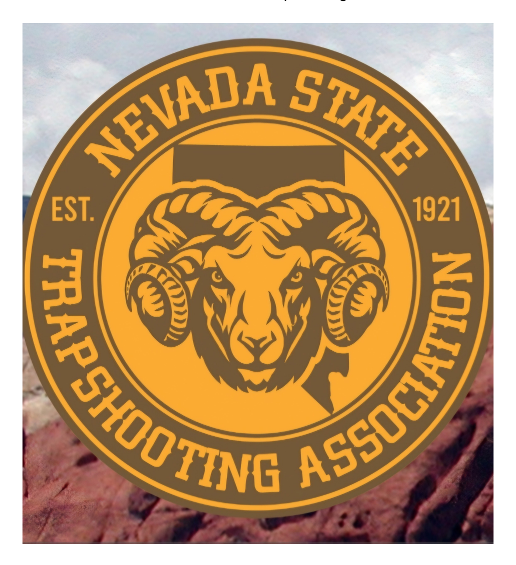
January Nevada State Trapshooting Association Newsletter

Winter weather in Nevada ranges from many feet of snow in the mountains of the north, to milder, but still chilly desert winds in the south.