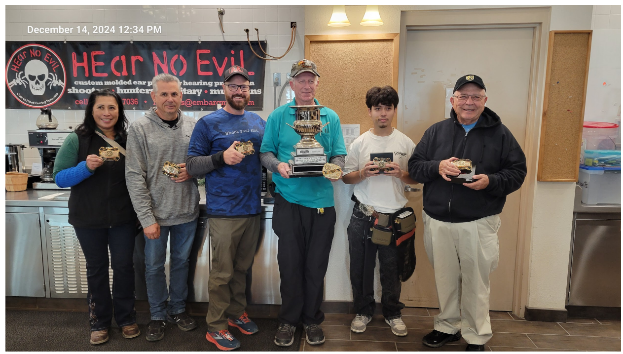
Race for the Buckle winners

The Race came right down to the wire. 2024 winners were, L to R: