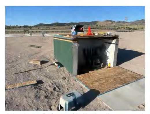
A fourth trap field was added in time for summer shooting at Pioche.

Shooters are headed next month back to Lincoln County Trap Club in Pioche, or to Mason Valley Gun Club, near Yerington, Nevada, for the Western Zone shoot July 18-20.