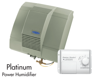
Platinum Power Humidifier