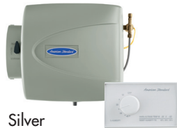
Silver Small Bypass Humidifier

Improve the comfort in your home and protect your wood floors and furnishings with an American Standard Humidifier. Our whole-home humidifiers are designed to work hand-in-hand with your comfort system to deliver the right amount of moisture, enhancing your system's performance and your level of comfort.