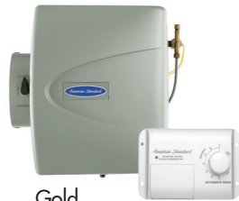
Gold Large Bypass Humidifier