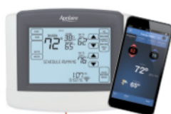
Model 8620/ 8620W with IAQ Control