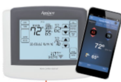
Model 8910/ 8910W with IAQ Control