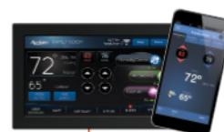
Model 8920W with IAQ Control