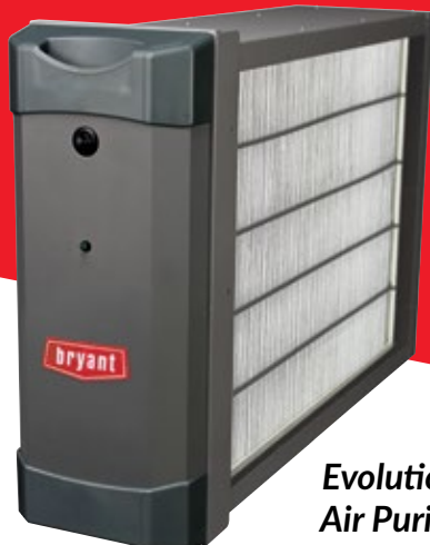
Evolution® Air Purifier

MERV (Minimum Efficiency Reporting Value) is a rating of your air filter's ability to remove dust from the air that is passing through.