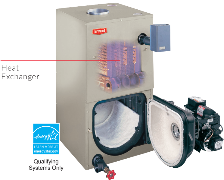
PREFERRED 86 OIL BOILER Model BW5 Shown

Both our Preferred 86 oil boilers, models BW5 and BW4, provide dependable heating and energy-efficient comfort backed by one of the most trusted and recognized names in comfort: Bryant.