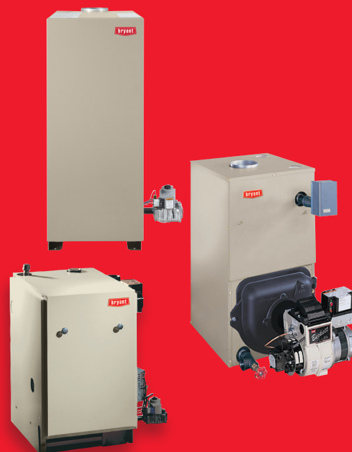
Models BW5, BW4, BW3, BWB, BS2

Gas and oil boilers with up to 86.2% AFUE