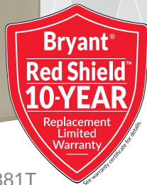
Models 880T and 881T