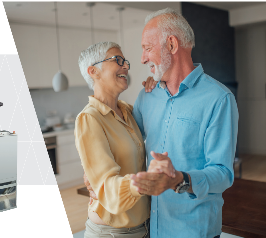
Models FE4, FE5, FT4, FJ4, F54, FMC, FMU, FMA