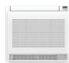
40MBFQ Console SIZES: 12 / 18 / 24