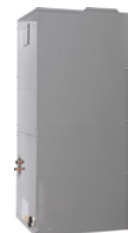
40MBAA Air Handler SIZES: 24

Note: Multi-zone units cannot heat and cool simultaneously.