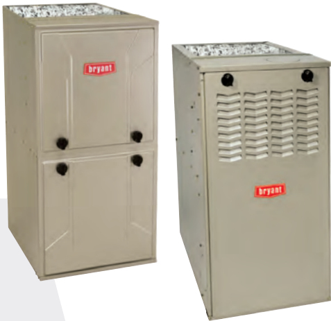
Keep your family comfortable this winter with a Bryant® ultra-low NOx gas furnace.