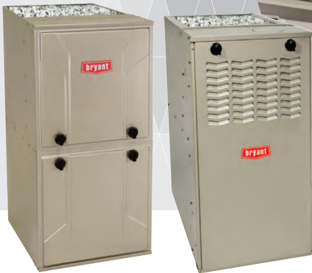
Models 935CA, 830CA, 935SA, 830SA