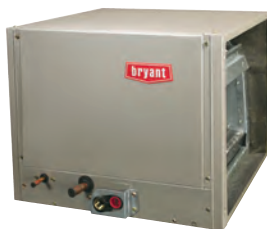
Model CNPHP Horizontal Cased N-Coil