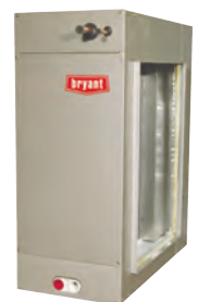
Model CSPHP Horizontal Cased Slab Coil