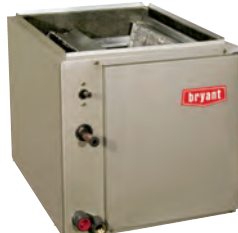
Model CNPVP/T Vertical Cased N-Coil Transition Width