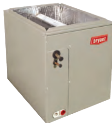
Model CAPVP Vertical Cased A-Coil