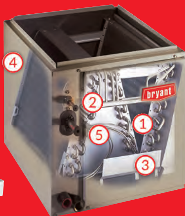
Model CNPVP Vertical Cased N-Coil