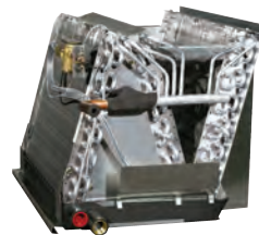
Model CNPVU Vertical Uncased N-Coil