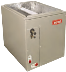
Model CAPMP Multi-Poise Cased A-Coil