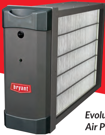
Evolution™ Air Purifier

MERV (Minimum Efficiency Reporting Value) is a rating of your air filter's ability to remove dust from the air that is passing through.