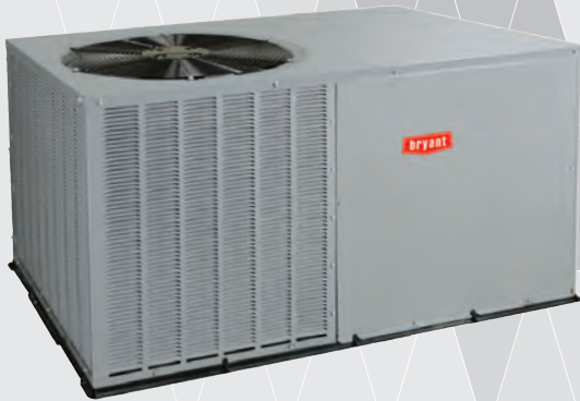
Models PA4Z & PH4Z