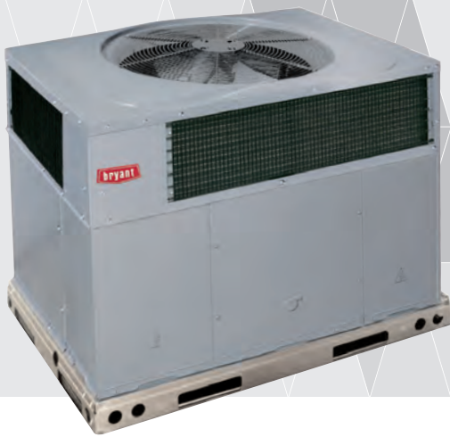
Models 707C & 577C