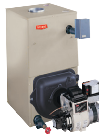
Model BW4/5 Oil-Fired Hydronic