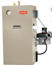
Model BW9 Gas-Fired Condensing Hydronic