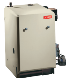
Model BW3 Gas-Fired Induced Draft Hydronic