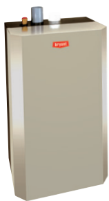
Model BWM Modulating Condensing Hydronic