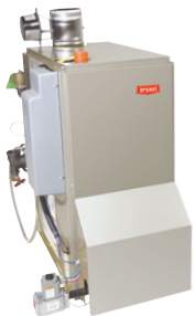
Model BWB Gas-Fired Hydronic