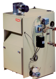
Model BS2 Gas-Fired Steam