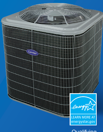
Qualifying Systems Only

Proven, reliable comfort, up to 16.5 SEER2 rating