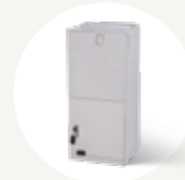
AIR HANDLER 45MBAA

2 The 45MPHA indoor unit is compatible with the 37MGRA multi-zone heat pump