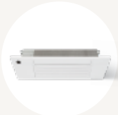
ONE WAY CASSETTE 45MCCA