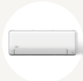
INFINITY HIGH WALL 2 45MPHA