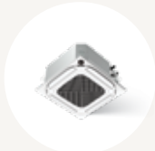
4-WAY CASSETTE 45MBCA

Cassettes offer quiet, even airflow without taking up wall or floor space, ideal for open layouts and multi-use rooms.