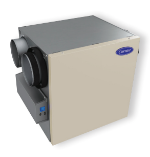
ERV/HRV ERVXXSHA ERVXXSHB HRVXXSHA HRVXXSHB

ERV/HRV ERVXXSVA ERVXXSVB HRVXXSVA HRVXXSVB