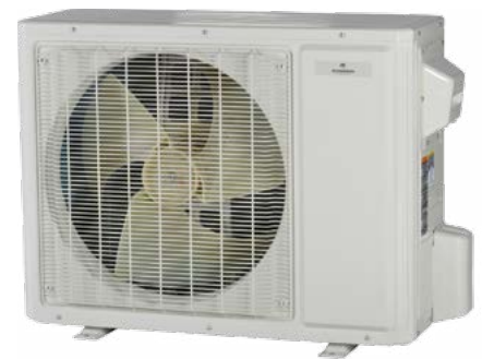
208/230V 9K-24K BTU/H INVERTER-DRIVEN HEAT PUMP SYSTEMS