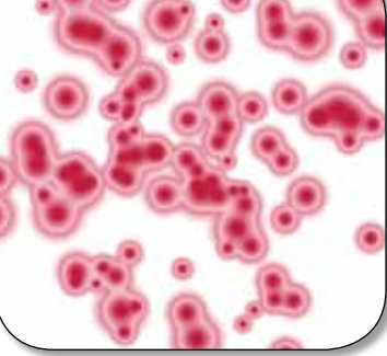
Mold Spores Size (micron) 3–10

Bacteria and mold spores contribute to making your home's indoor air quality up to 100 times worse than the air outside, according to the EPA.