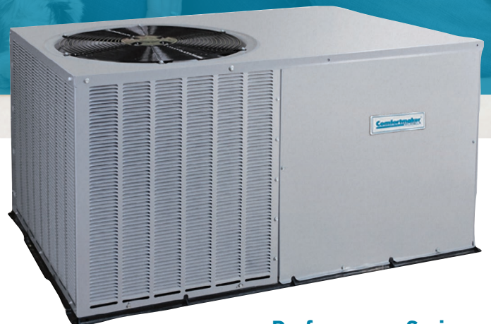
Performance Series PAJ4/PHJ4

*To the original owner, when product is used in a residential application, a 10-year parts limited warranty upon timely registration of your new equipment. Warranty period is 5 years if not registered within 90 days. Jurisdictions where warranty benefits cannot be conditioned on registration will automatically receive a 10-year parts limited warranty. See warranty certificate for complete details.