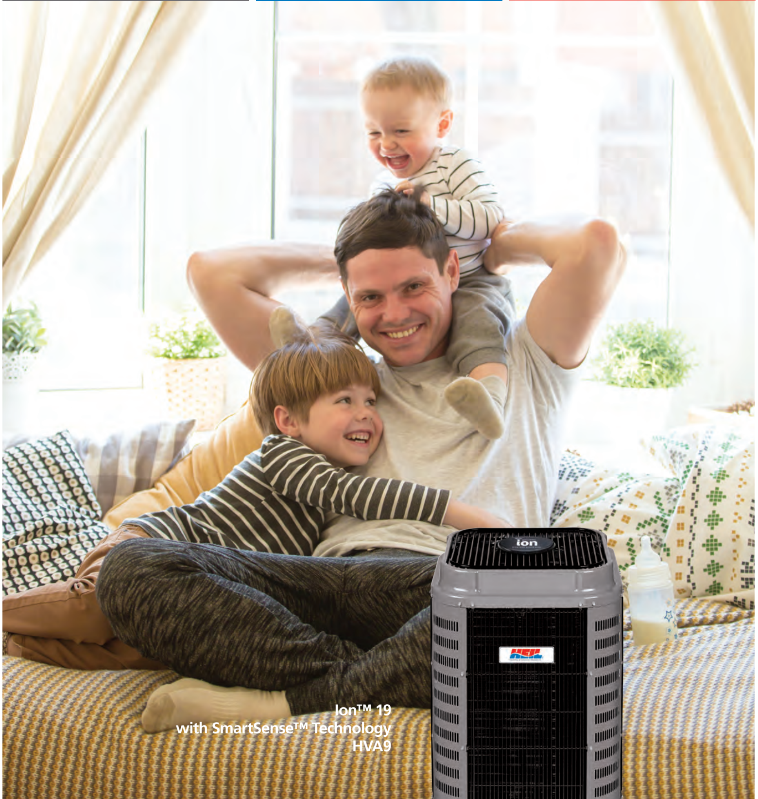
Ion™ 19 with SmartSense™ Technology HVA9