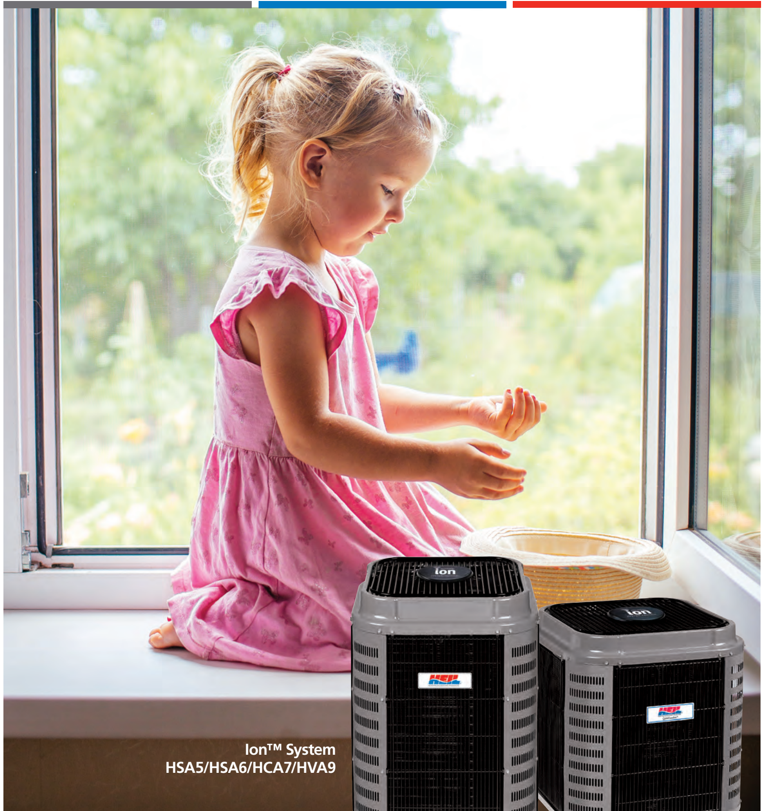
Ion™ System HSA5/HSA6/HCA7/HVA9