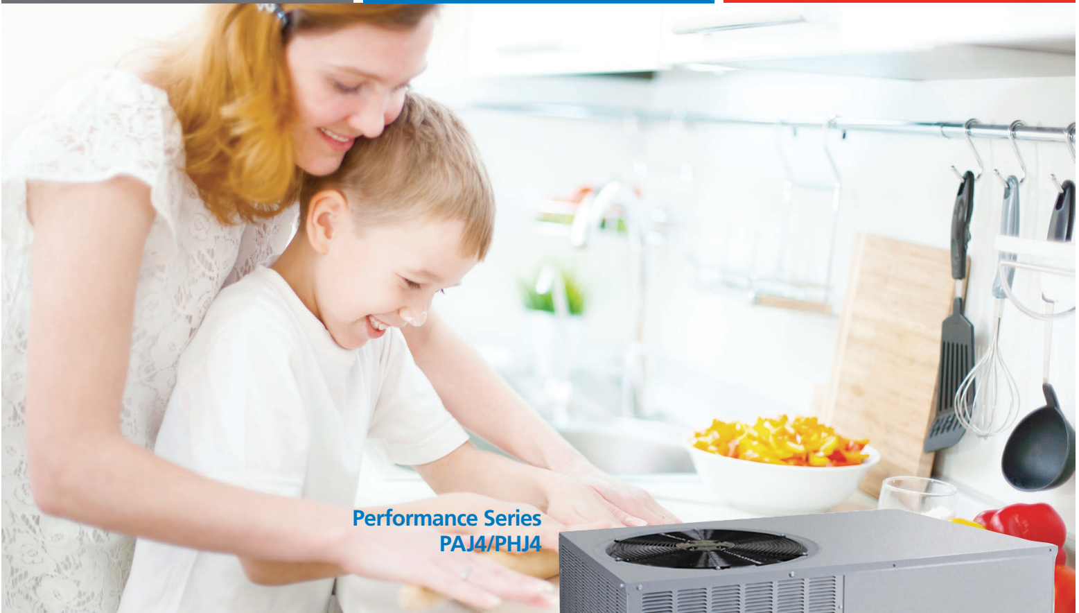
Performance Series PAJ4/PHJ4