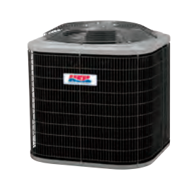
Heat Pumps Provides efficient cooling/ heating for comfort and potential energy savings