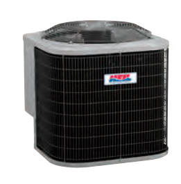
Air Conditioners Provides efficient cooling for comfort and potential energy savings.

Thermostats Wi-Fi<sup>®</sup>-enabled smart thermostat learns your schedule for greater efficiency and comfort.