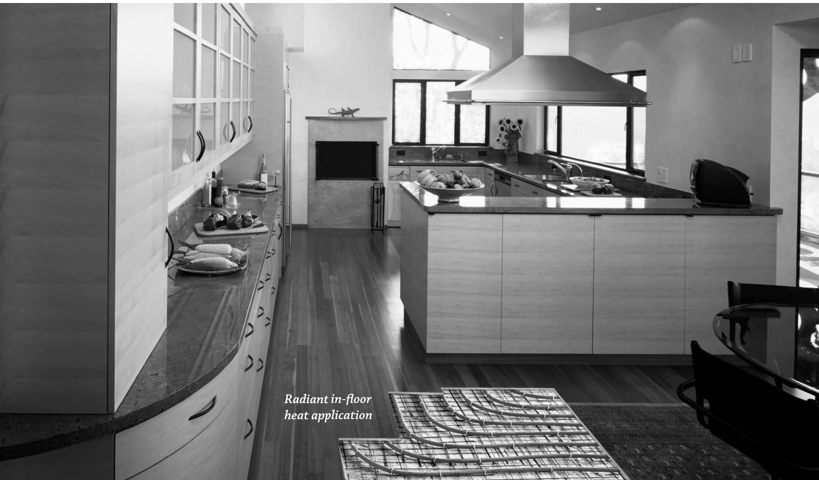
Radiant in-floor heat application

Published ratings are based off of a Full Load Cooling RPM of 3750, a Part Load Cooling RPM of 1800, a Full Load Heating RPM of 6000, and a Part Load Heating RPM of 2600.