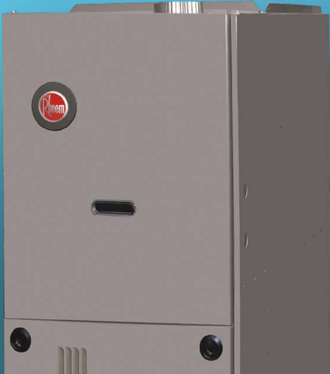
Downflow model shown

From the smallest part to complete comfort systems, we build quality into everything we make so we can be sure it's tough enough to deliver the ultimate performance you can count on day after day, year after year. That reliability is what makes Rheem different—and better.