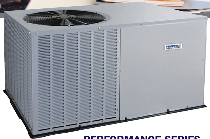
PERFORMANCE SERIES PAJ4/PHJ4

Tempstar packaged all-in-one units are designed for the best durability and comfort. The units stay enclosed outside or on roofs and come in a variety of combinations: dual fuel gas furnace/heat pump, gas furnace/air conditioner, electric heat pump and electric air conditioner.