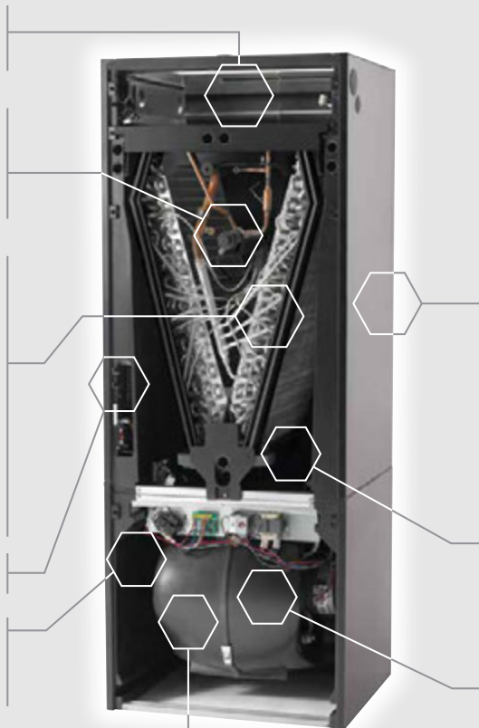
Features and components applicable to Hyperion TAM8 Series only, may vary by model and are shown for illustration purposes only.

➤ Unique Cabinet Design built with tough, double-wall construction and enclosed foam insulation virtually eliminates sweating and condensation. Less moisture and fewer dust particles are drawn in from garages, attics or crawl spaces, helping improve indoor air quality. The cabinet interior is also easy to clean.