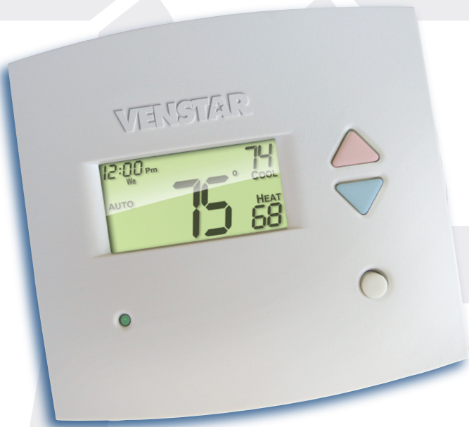
4.8" w x 4.3" h x 1.1" d