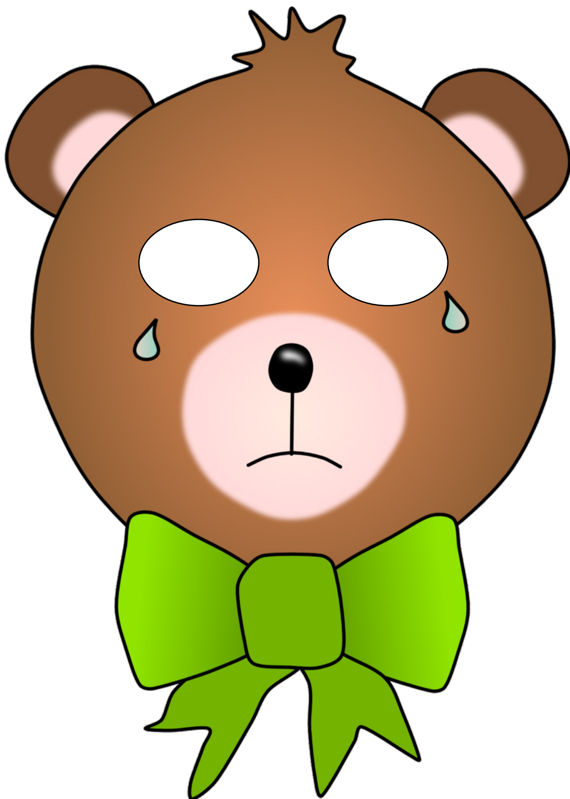
Baby Bear sad