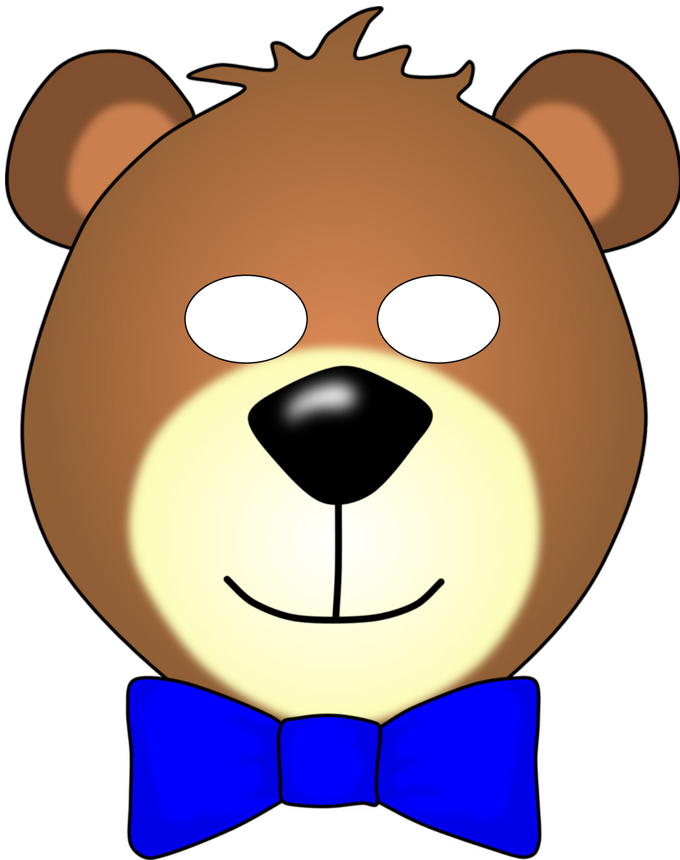
Daddy Bear happy