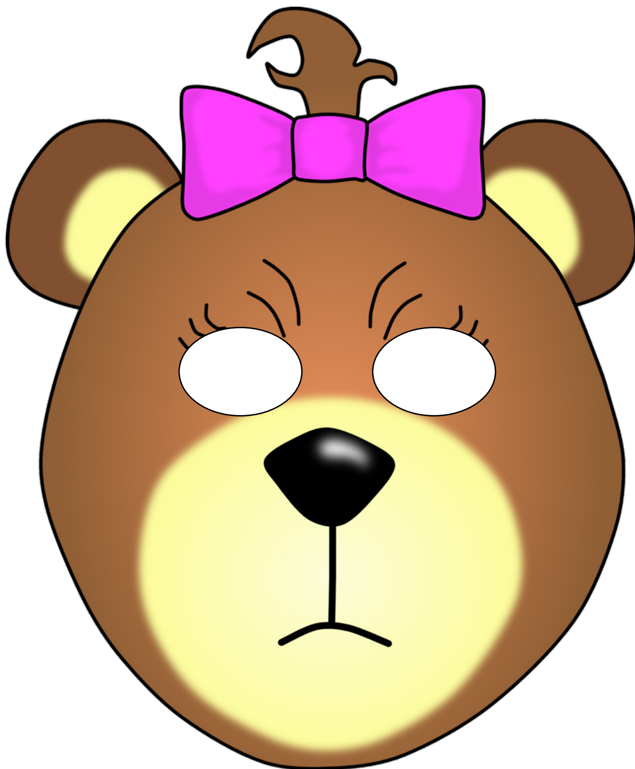
Mummy Bear cross