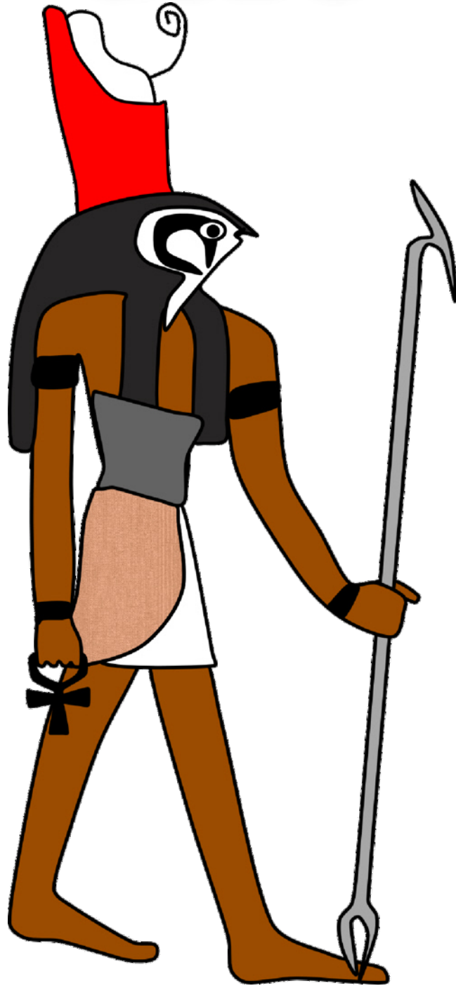
Horus God of pharaoh