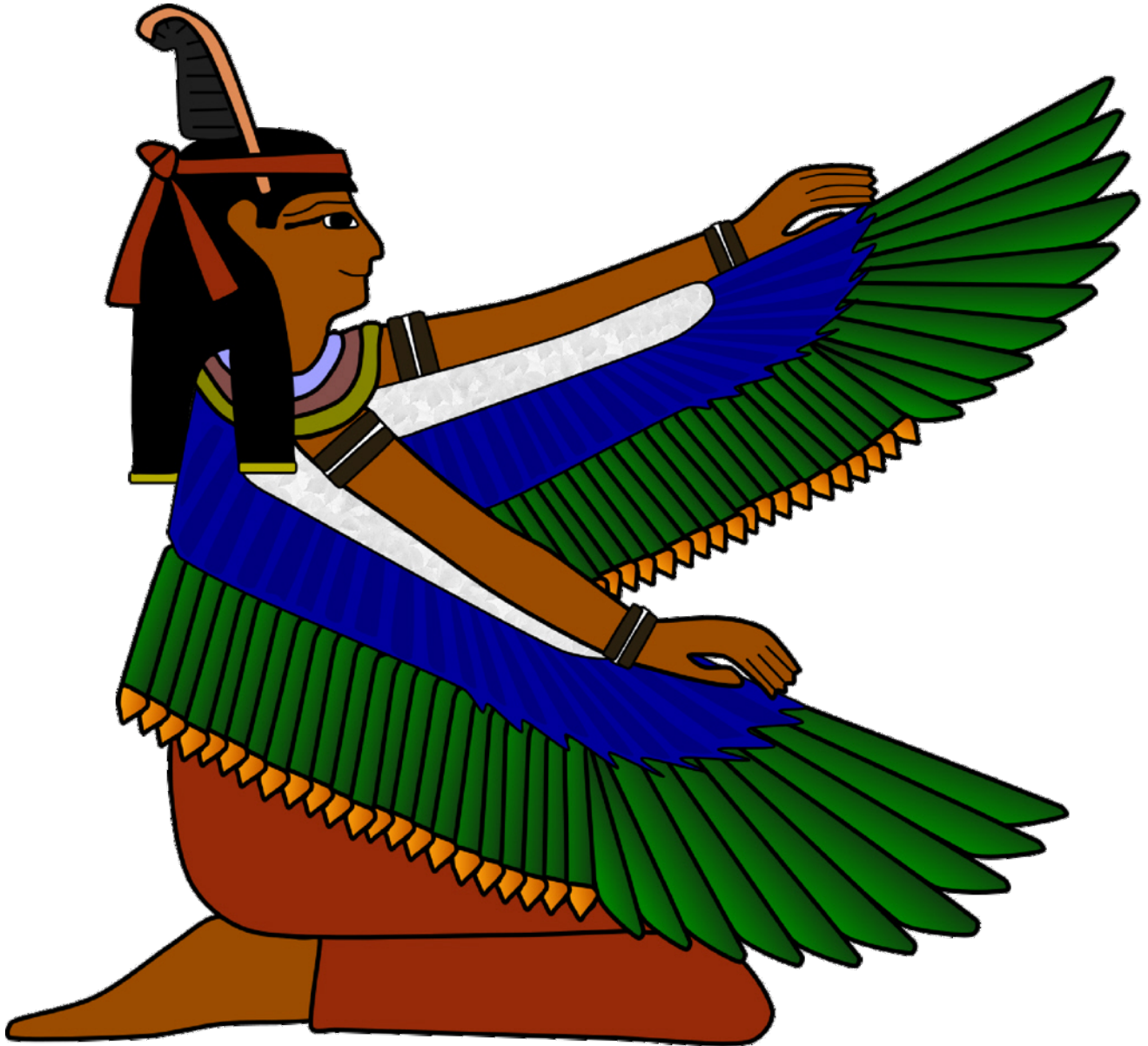
Ma'at Goddess of justice