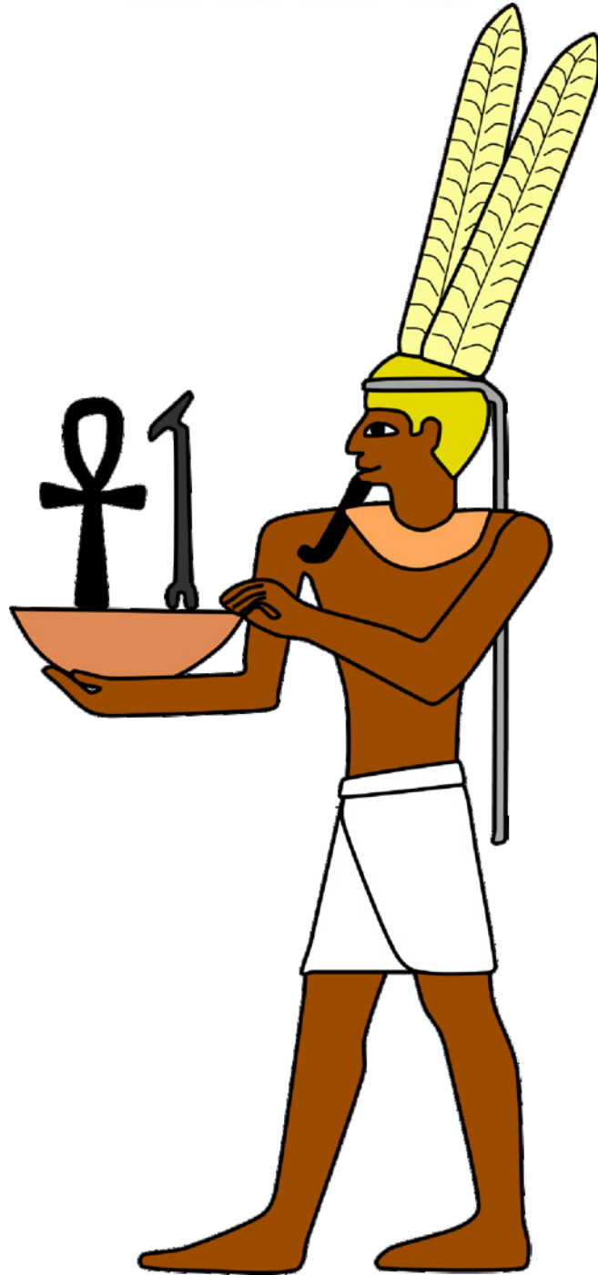
Amun God of creation