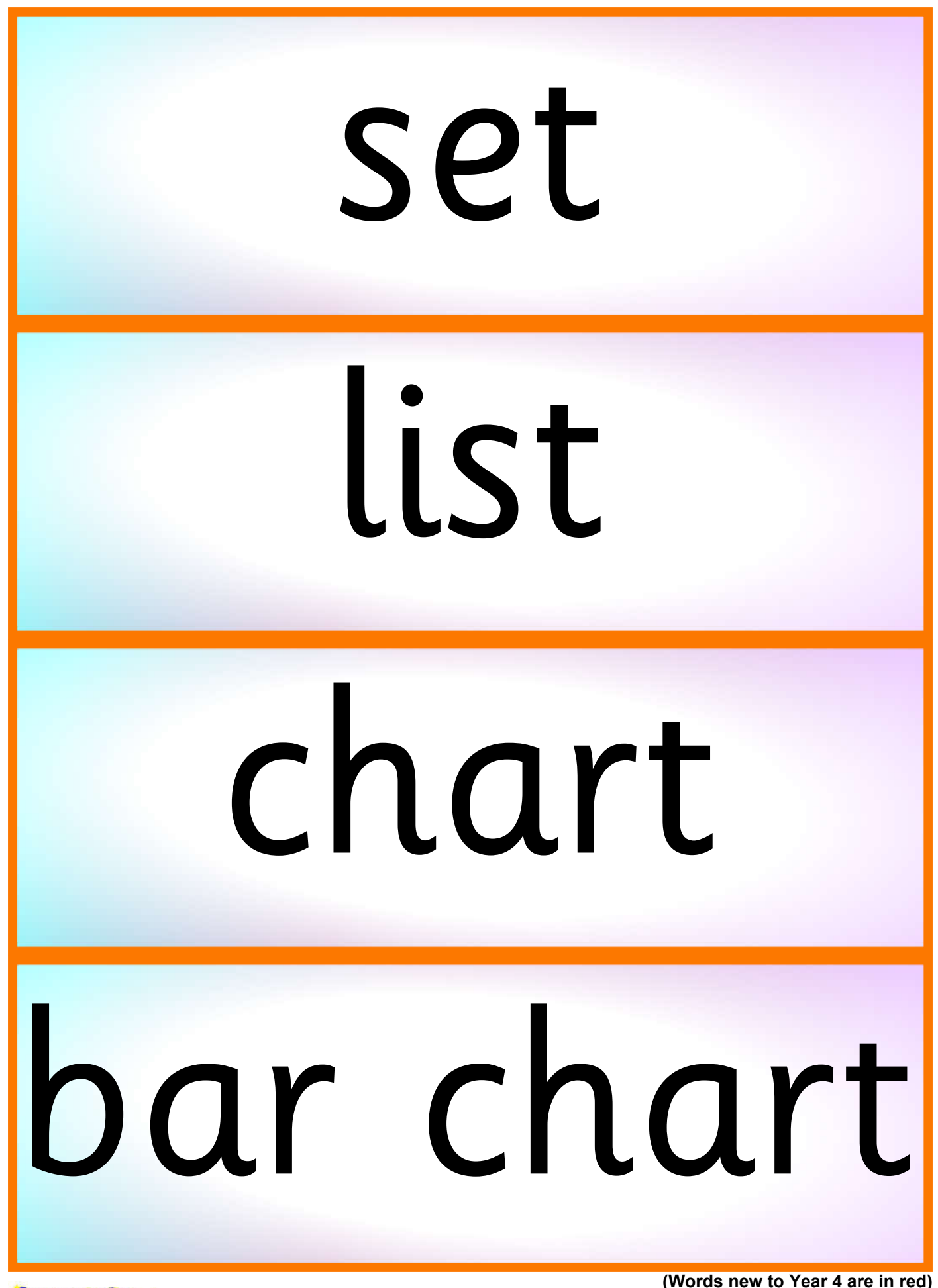
Year 4 mathematics words: Handling data