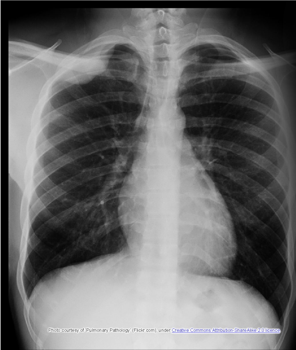
Photo courtesy of 'Pulmonary Pathology' (Flickr.com), under Creative Commons Attribution-ShareAlike 2.0 licence