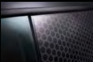
Create a uniform relief cut between window graphic and rubber molding.