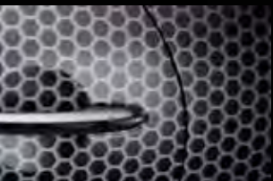
Evenly cut in gaps between car panels.