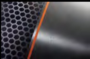
Create consistent pinstripes using any wrap films.