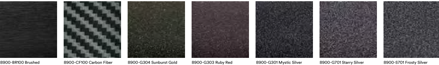
Pictures show 3M Wrap Overlamine Series 8900 laminated on 3M™ Wrap Film Series 1080 – M12 Matte Black