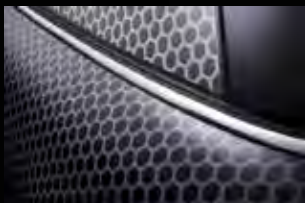
Follow contours and curves on any part of the vehicle.