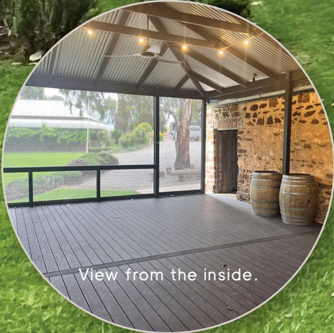
View from the inside.