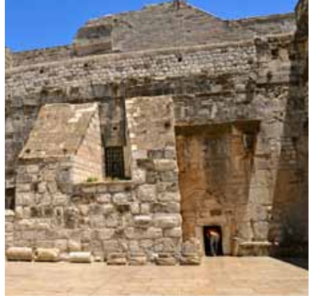
Church of the Nativity