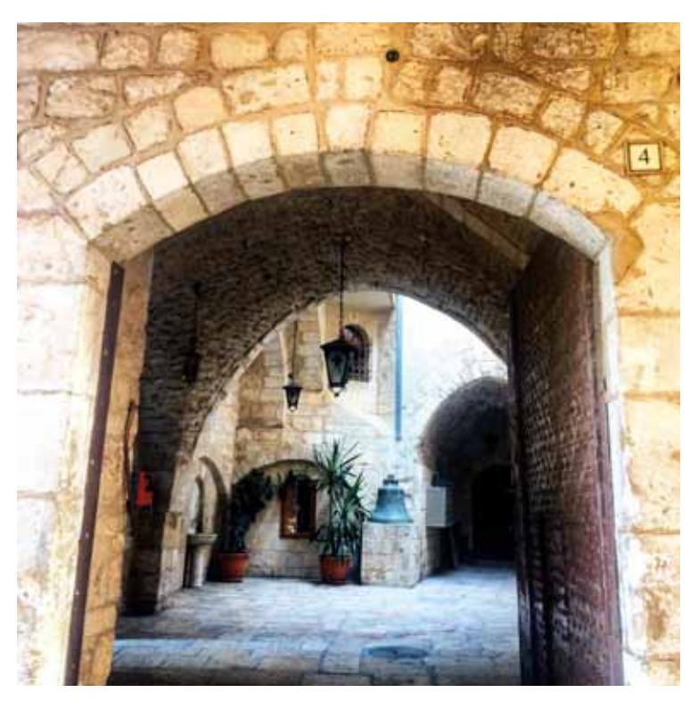
Doorway in Jerusalem