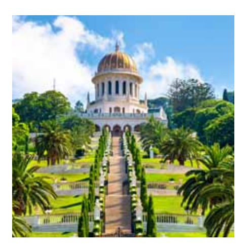
Baha'i World Center, Haifa