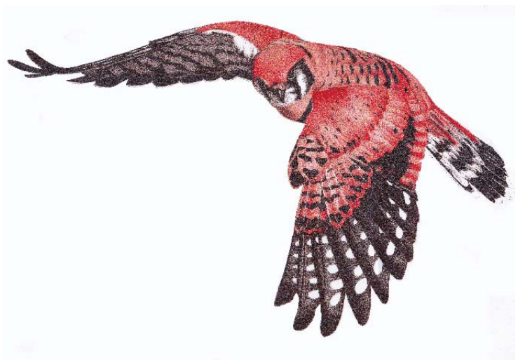
Featured artwork of Landry

Responses which are two ribbons or less are not recommended reading.