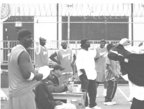
Saturday Morning Competition

team is open to any man with the right attitude, spirit and