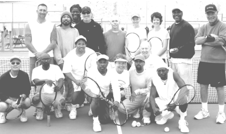
Inside Tennis Team with Brad Gilbert (Back row fourth from the left)

Last month Brad Gilbert came to San Quentin to visit with the Inside Tennis Team, giving pointers on how team members could improve their game.