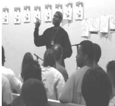
Preacher Teaching R/C Offenders